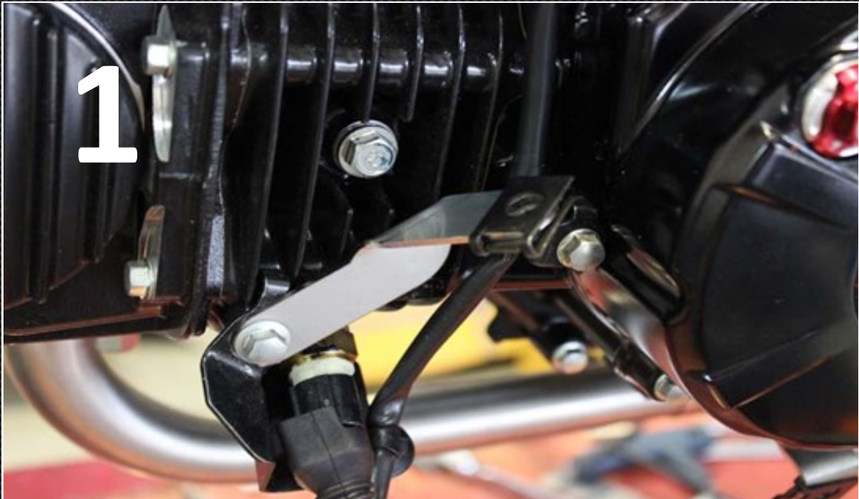
1) Front left stay uses the thermostat mounting bolt and fitted as shown in the photo.

The first job is to install the stays. At this stage install hand tight so that stays can be adjusted if necessary.