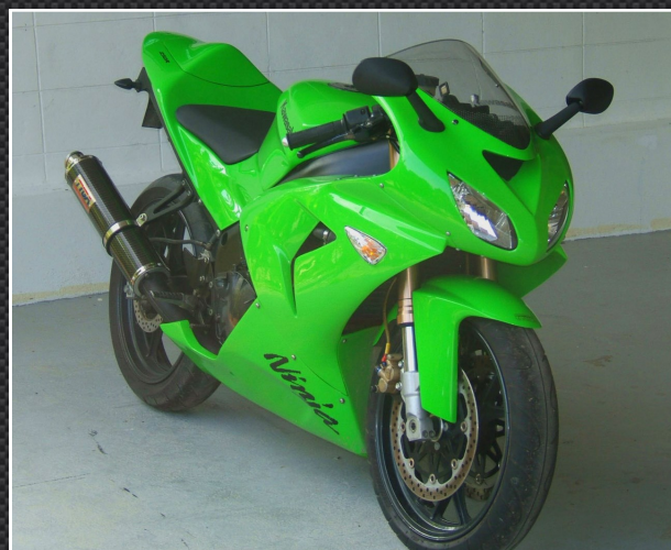
Painted kits available at the website