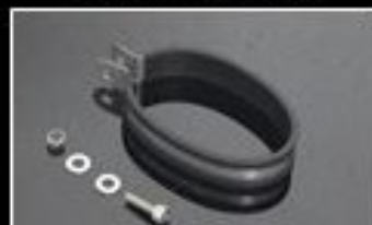
1x Clamp Oval