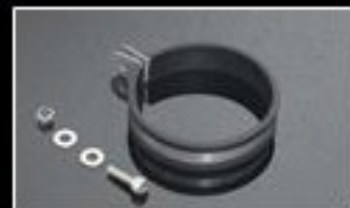
1x Clamp Round or