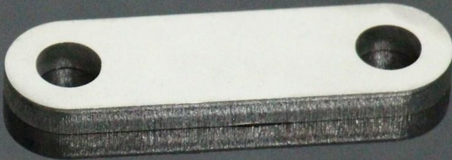
BPSY-0257 Side Stand Spacer

Now pop the bike back onto the side stand, and remove the center stand and all associated components. We won't be using any of it.